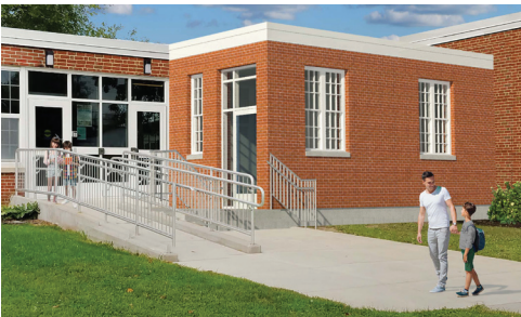
This is a rendering of the renovated entry way for Clarence Center Elementary School. All six schools will have their main entrance reconfigured to be more secure.