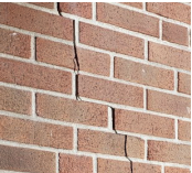
All of the school buildings need some level of brick repair and maintenance work.