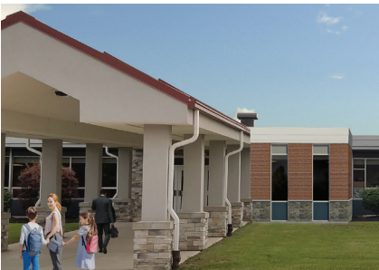
This is a rendering of the renovated entry way for Ledgeview Elementary School.