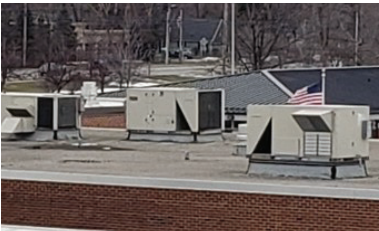
A number of air-handler units at all of the buildings are past their useful life and in need of replacement.