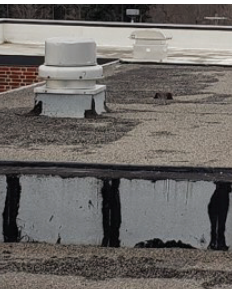
The District has over 800,000 square feet of roofs. This project would replace approximately 100,000 square feet of the roofing in buildings where it is past its useful life.